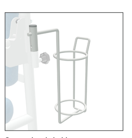
Oxygen bottle holder.