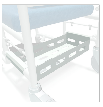
Patient belongings tray.