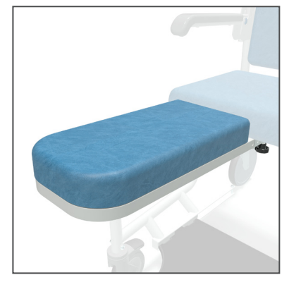
Stowable patient leg support.