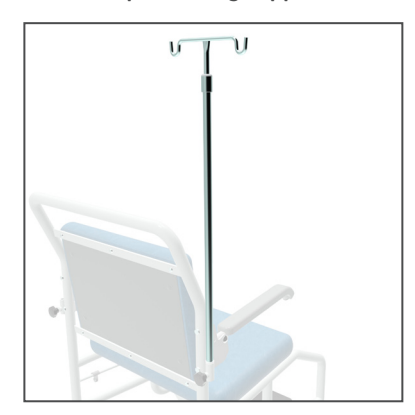
IV pole attachment.