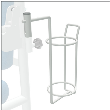
Oxygen bottle holder.