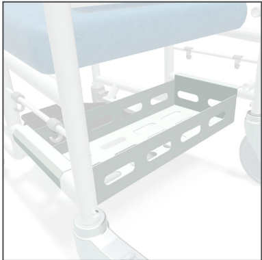
Patient belongings tray.