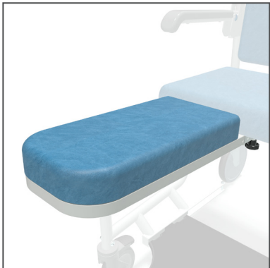
Stowable patient leg support.