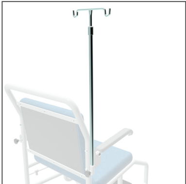
IV pole attachment.